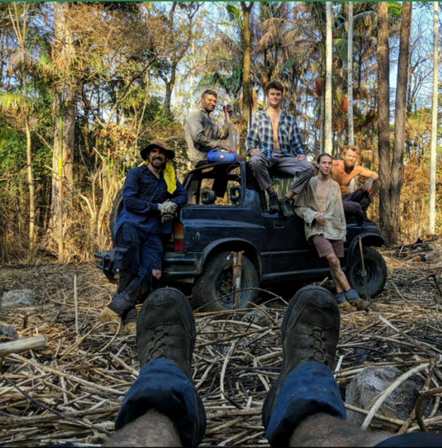
The Vitara was our first car in 2018 and part of planting over 700 000 trees before she had to retire in 2024.

We are so lucky SCJ came along when you did with this generous donation. We stated when asking for your support, that at times unexpected costs come along and they did this year..